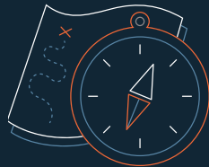
GRC & STRATEGY